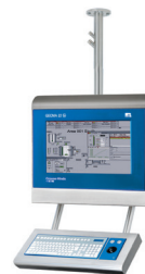
Ceiling mounting (on request)