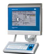
Wall mounting (on request)