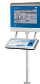
Floor mounting (standard)